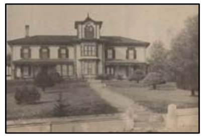
Information excerpted from the Maine Historic Preservation Commission submittal to the National Register of Historic Places, and Paul Mills, Esq.