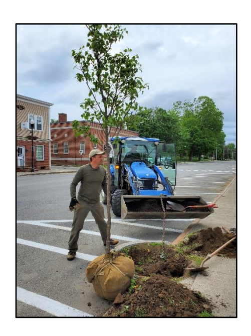
Tree Planting in the Downtown