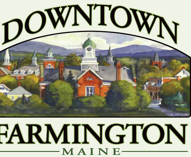
This map funded by Farmington TIF funds.

Wilson Lake Inn & Suites 183 Lake Road, Wilton 207-645-3721 • www.wilsonlakeinn.com